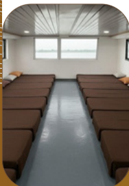
Deck Upstair Sea View