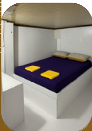
Private Cabin Standard