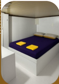
Private Cabin Standard